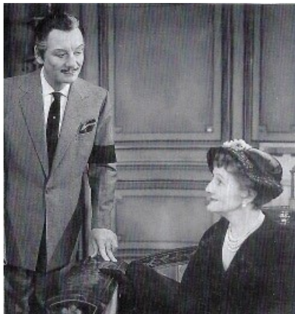
John Gielgud as Sebastien and Joyce Carey as Isobel

We commenced with 12 devotees from 2023 and one new one who pulled out when she realised she wasn't about to become a performer! All were intrigued with our first reading – Noel Coward's Nude With a Violin – first staged in 1956 and directed by John Gielgud.