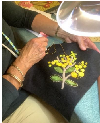
Busy hands, beautiful work