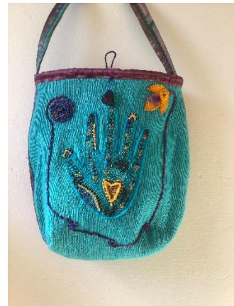
Literally, as mentioned, a 'hand' bag