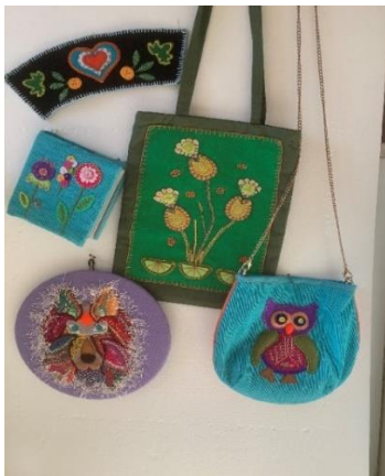
Selection of embroidered pieces

Feedback has indicated that everyone was happy with this approach, although for some a sampler of stitches at the outset could have been useful. Most also suggested they would have liked longer sessions as our 2 hours disappeared very quickly, so some helpful suggestions to incorporate for future classes if/when they are offered. Helen